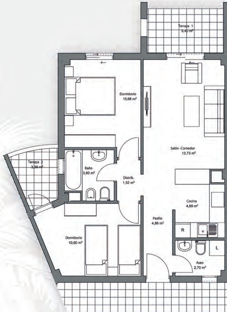
Apartment type RA1 - 2 Bedroom