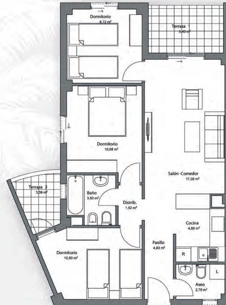
Apartment type RA3 - 3 Bedroom